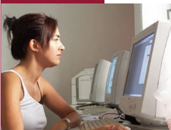
German Leaving Cert classes are available during school year in Dublin.